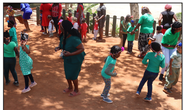
Flower Festival celebration at NWST(Circle Game)