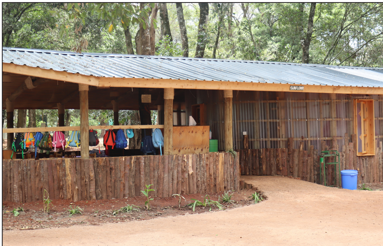
Sunflower Class, NWST Karen Campus, Nandi Road

The Nairobi Waldorf School Trust is primarily financed with income from school fees.