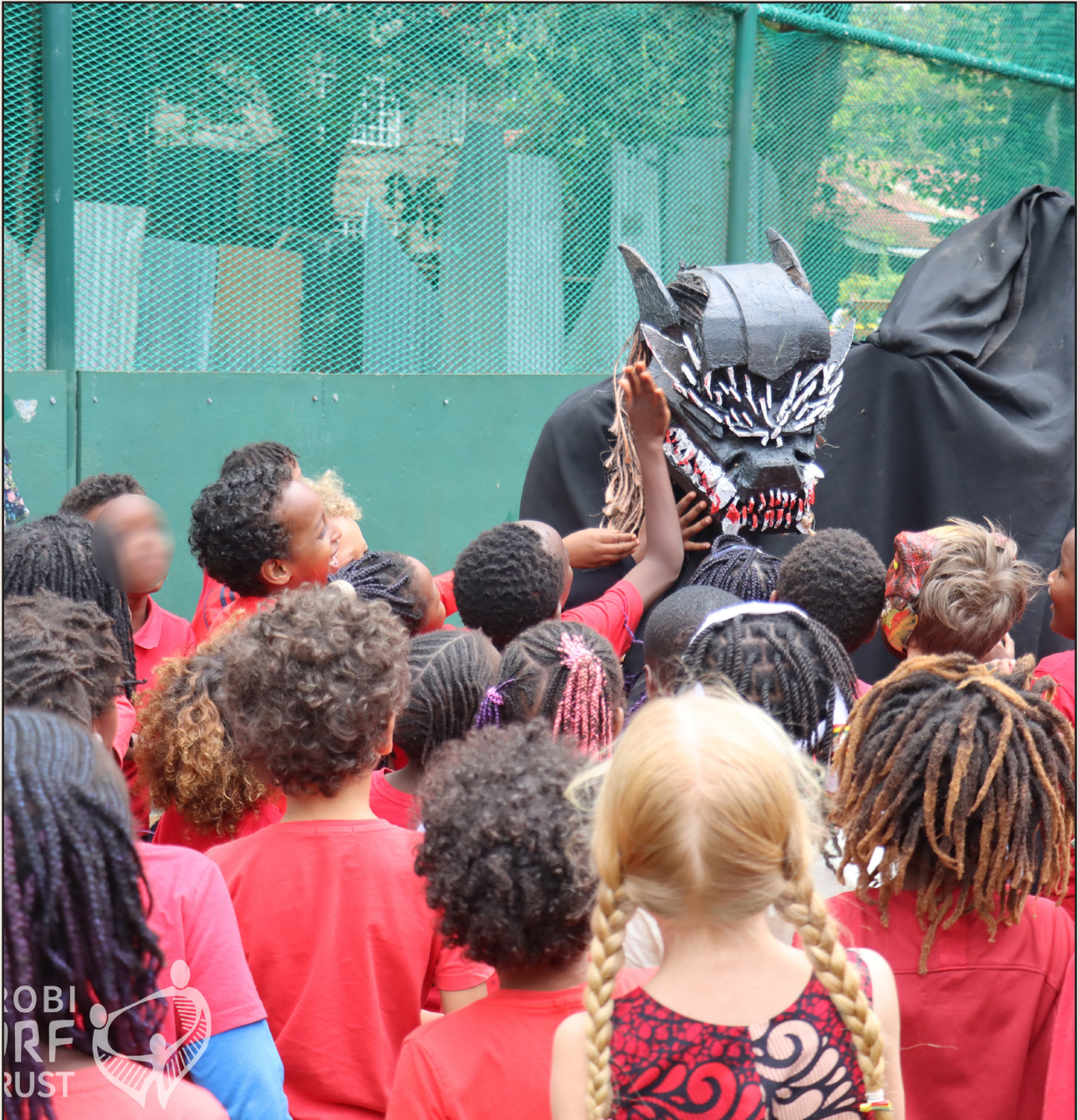
NWST Students Playing With the Dragon During the Festival of Courage