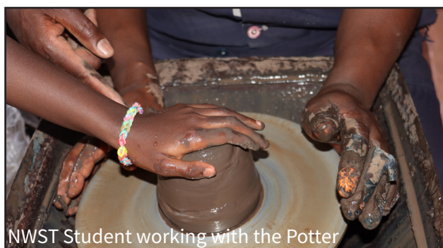
NWST Student working with the Potter

These activities align with Rudolf Steiner's idea of handwork in school. It's not about making artists; it's about teaching students practical skills and building their confidence to tackle life's challenges. We're happy to see our students learn and grow through these experiences.