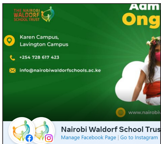
NWST Facebook Page