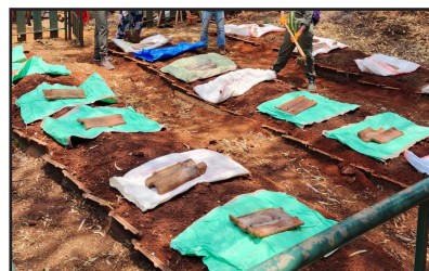
Left to Right: NWST Students and Parents Preparing the Garden for Planting