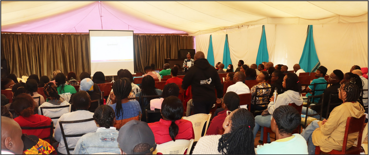
A Previous Meeting at NWST

Anthroposophical Studies - the philosophical foundation behind practices like Waldorf Education and Biodynamic Farming, is embraced by a small community of about seven members in Kenya. Anthroposophical Studies involve a broad exploration of spiritual and philosophical concepts, so these meetings provide a welcoming space for individuals interested in gaining a more profound understanding of this philosophy. These studies are organized monthly and are open to anyone eager to delve deeper into Anthroposophy. They take place at two different locations: Either the Rudolf Steiner School in Mbagathi or at NWST, Karen Campus Nandi Road.