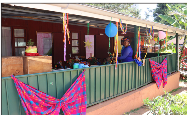
Flower Festival celebration at NWST

Festivals play a significant role in the life of a Waldorf school. They help children connect with the natural rhythm of the seasons and the passage of time. It's a way for them to understand that there's something greater than themselves. It's about teaching them that there's a big, beautiful world out there. It's a natural and meaningful part of our school life.