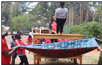
Free Falling Challenge