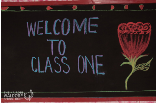
Previous Photos of The Rose Ceremony