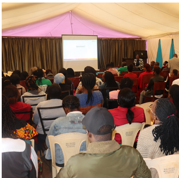
NWST Community at the 2023 AGM.

At the heart of our Waldorf educational journey lies a cornerstone that radiates strength, connection, and mutual growth - the power of community and parental involvement. We are excited to shed some light on the significance of active participation and engagement in school activities and meetings, as well as the invaluable role you play in nurturing the unique spirit of our Waldorf community.