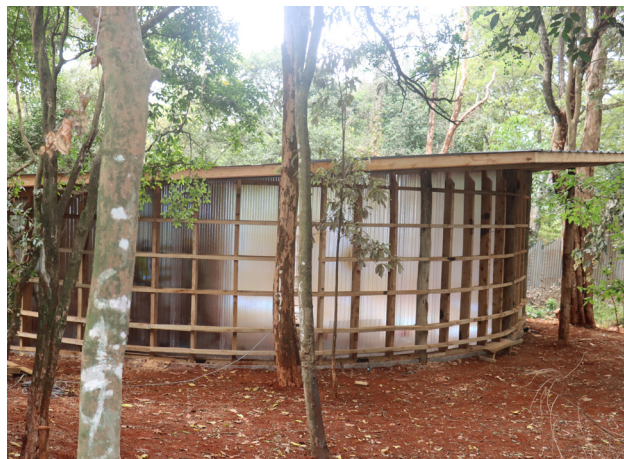
Ongoing construction at the NWST Karen Campus, Nandi Road

Currently, Phase 1.1 (classrooms and toilets) and Phase 1.2 (dining hall) are simultaneously under construction.