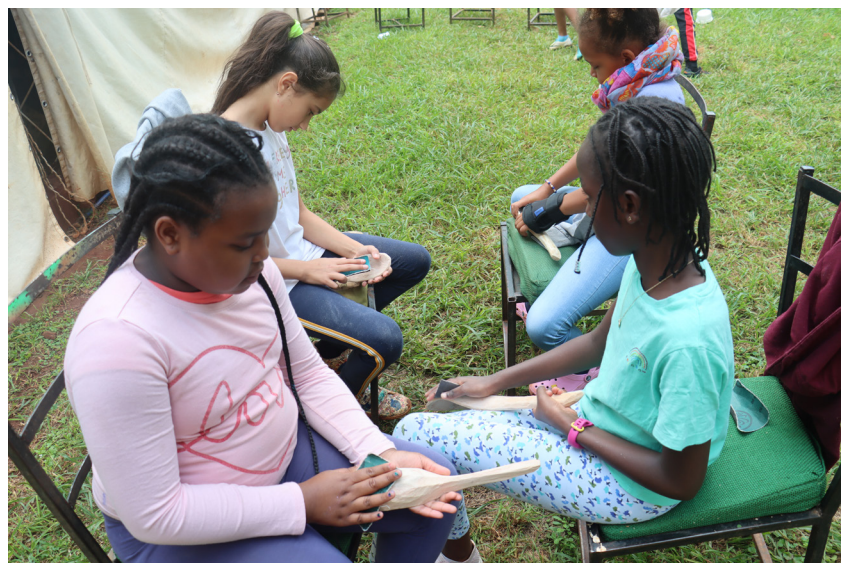
NWST Students in their Woodwork Lesson

As we continue this awe-inspiring journey through Waldorf education, let's celebrate the magic that unfolds within our classrooms. Every brushstroke, every story told, and every moment of wonder is a testament to the unique beauty of the Waldorf experience.