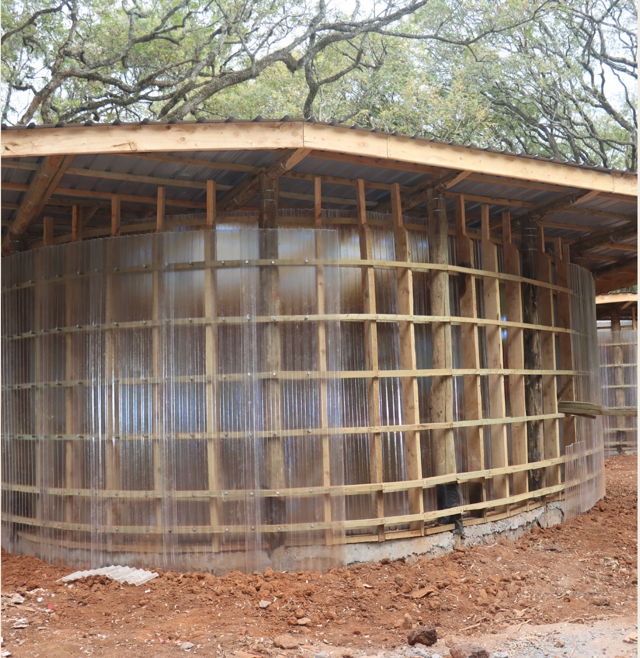
Ongoing construction at the NWST Karen Campus, Nandi Road