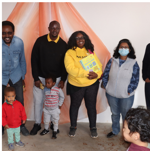
NWST Parents at The NWST Lavington Campus Library Launch study sessions open the door to exploring the Waldorf philosophy and its impact on our children's development.

We invite you to join us in our activities that not only foster strong bonds but also showcase the distinctiveness of the Waldorf approach. Our coffee mornings provide an informal space for sharing insights and stories. Class socials offer an opportunity to connect with fellow parents and celebrate our children's growth together. Parents'