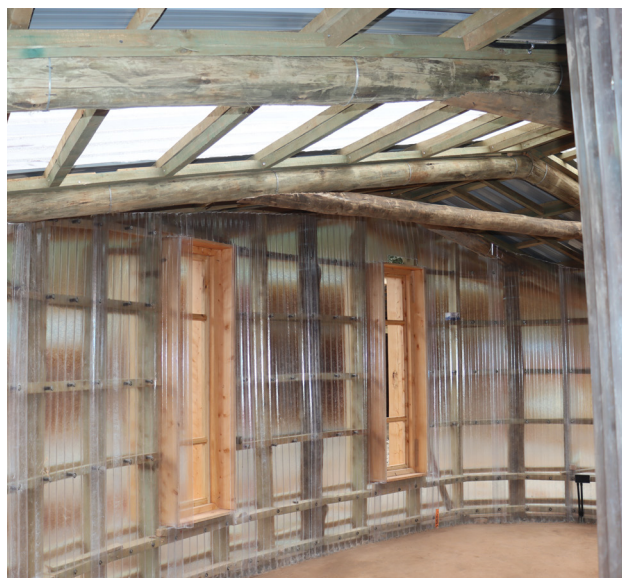
Ongoing construction at the NWST Karen Campus, Nandi Road

The consultants' team is awaiting the evaluation of the tender package for Phase 2 by the Construction Committee. This phase will involve negotiations with the contractor for the subsequent construction stage, which is slated to commence after the current phases are completed.