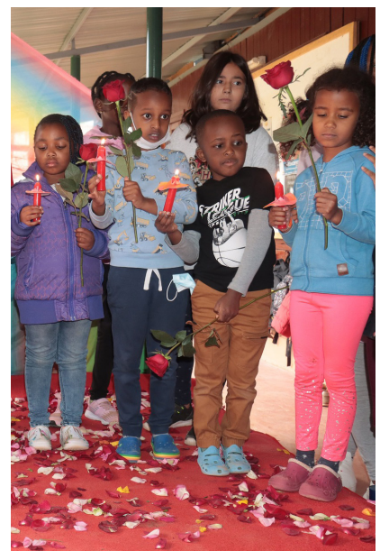
Students Celebrating a previous Rose Ceremony

Throughout this period, spanning from first to eighth grade, the teacher assumes the role of a bridge between the child and the outer world. This is where the integration of storytelling into the curriculum gains immense importance.