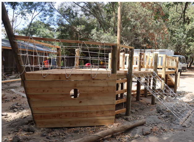
Ongoing construction at the NWST Karen Campus, KG's Boat