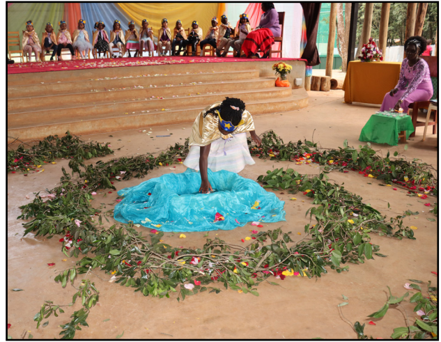
A KG student placing a candle in the middle of the Waldorf Spiral