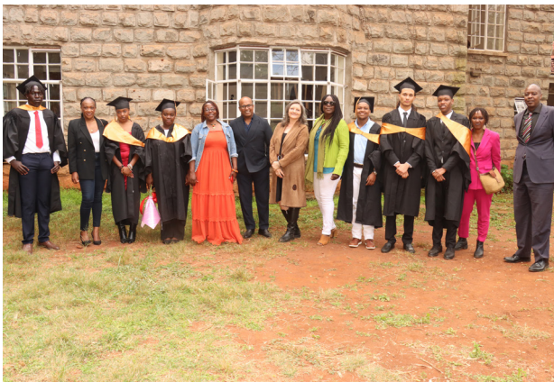
IBDP Graduates, with their parents