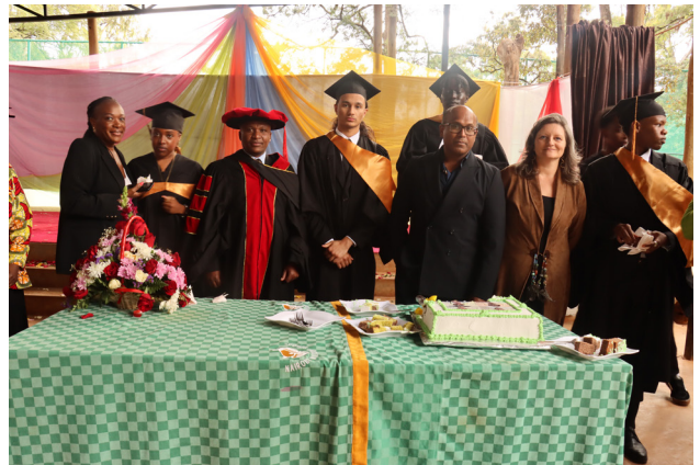
IBDP Graduates getting ready for cake cutting

The NWST community congratulates you on completing your high school studies. As the first graduating class from NWST, you will always hold a special place in our hearts. May you find fulfillment in all your endeavors. Congratulations once again!