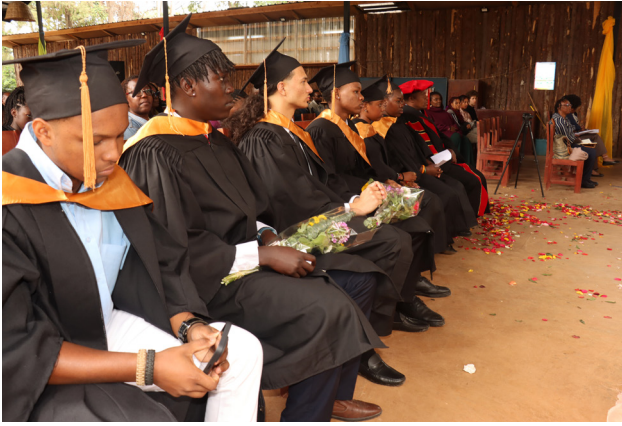
IBDP Graduates Class of 2024