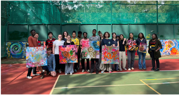
Geneva and NWST students posing for a picture