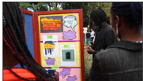
IB DP students engaging with fellow students.