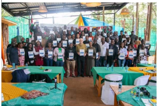
GPTS Participants Posing for a Photo Outside The Nandi Road Campus Multi Purpose Hall