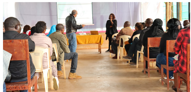
Community members participating in the public meeting

We extend our heartfelt thanks to the NWST community members who attended these public participation meetings. Your involvement is crucial in shaping the future of our school, and we greatly appreciate your time and insights.