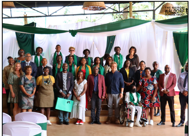
Class 8 students and NWST Community Members

At NWST, we celebrate significant milestones with transition ceremonies for both Class 8 and Kindergarten students, recognizing the importance of these special moments in their educational journey. The Kindergarten students walk down the spiral, a powerful symbol of their growth and development. As each child descends, their teachers read a personalized verse, celebrating their unique qualities and achievements. This heartfelt gesture emphasizes the individual paths each child takes as they prepare to move into primary school, marking the end of their early childhood experience.