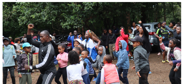
Walkathon participants gearing up with a warm-up session

We are thrilled to announce that we raised Ksh 273,538 at the walkathon.