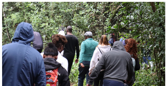
Walkathon participants hitting the trail