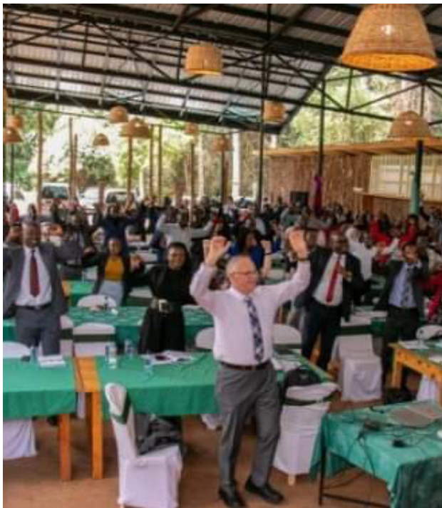
GPTS Participants Engaging in a Fun Exercise at The Nandi Road Campus Multi Purpose Hall