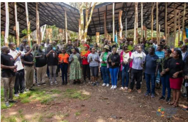
GPTS Participants Outside The Nandi Road Campus Multi Purpose Hall

The Great Places to School Workshop for the Global Peace Foundation was held at The Nairobi Waldorf School Trust for three days from April 11th to 13th, 2024, from 9:00 a.m. to 4:30 p.m. The theme for the workshop was “Transformative Education in the Global South Towards 2050.”