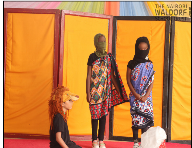
NWST students bringing stories to life in their class plays

Waldorf class plays are more than just a showcase of talents; they are an integral part of our curriculum. Each play is thoughtfully selected to align with the student's developmental stage, allowing them to explore characters, emotions, and narratives that resonate deeply with their age and experiences. Students work together, supporting and inspiring one another as they bring the play to fruition. From designing costumes and sets to coordinating movements and music, every aspect of the play results from teamwork and togetherness. Waldorf class plays embody the essence of our education philosophy – fostering wholistic growth, igniting imaginations, and nurturing the human spirit. We invite all members of our school community to make it a habit to come to witness the magic of Waldorf class plays. Each play is a unique and heartwarming experience, with laughter and moments of pure wonder. As the audience, you become part of the story, supporting our young actors on their journey.