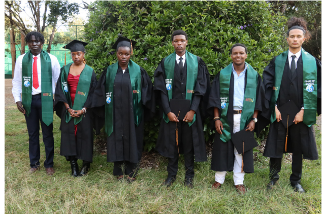
IBDP Graduates, Class of 2024

On June 27th 2024, NWST celebrated a joyous milestone as our first cohort of IB DP students graduated. The ceremony was filled with pride and happiness for the graduates, their parents, and the entire NWST community, especially since some students started in kindergarten at NWST. The graduates delivered heartfelt speeches, cheered on by their fellow high school students. A touching moment was when their former kindergarten teacher joined the celebration, reconnecting with them after many years. Congratulations to our pioneering IB DP graduates of 2024; we are incredibly proud of you all.