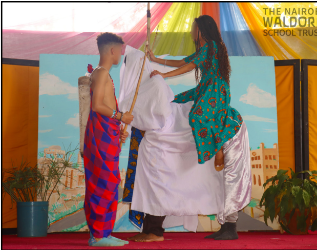
NWST students shining on stage during their class plays