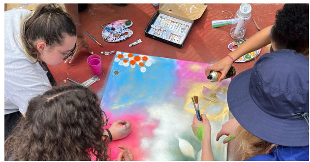
NWST and Geneva students painting together

The visit from the Geneva class brought a wave of excitement and curiosity to our school. It was a pleasant surprise to meet Grade 11 students from a distant country, adding a refreshing global perspective to our routine. We had an interactive session, sharing information about our schools and global issues in both parts of the world. The initial curiosity over their arrival quickly turned into genuine interest and eagerness to connect. This encounter highlighted the richness of cultural exchange.