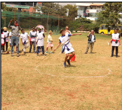
NWST student throwing javelin

On June 5th, 2024, our Grade 5 students participated in the Greek Olympics, an event that brought smiles and excitement to everyone involved. The sports ranged from javelin throws to wrestling and relays, creating an atmosphere of celebration as students cheered each other on. Parents joined in the cheering, adding to the joy and support. The Greek Olympics are an essential part of the Waldorf curriculum for Grade 5 students, promoting physical fitness, teamwork, and a deeper understanding of ancient cultures.