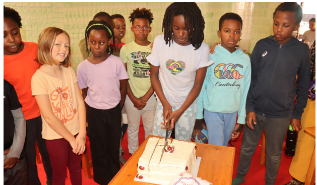
Celebrating victory with a sweet slice of success