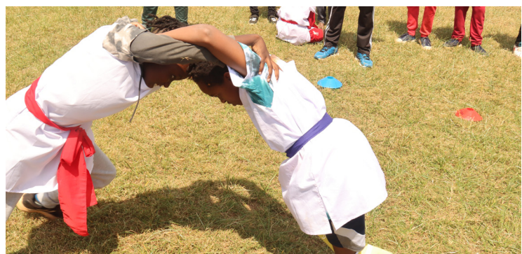
Students wrestling at the Greek Olympics Class 5 students

Colors can be assigned to teams to differentiate them and bring a sense of identity and pride, echoing the historical significance of these ancient communities. Spartan Team: Might wear red to symbolize their warrior spirit and strength. Athenian Team might wear white or blue to represent wisdom, purity, and the intellectual heritage of Athens.