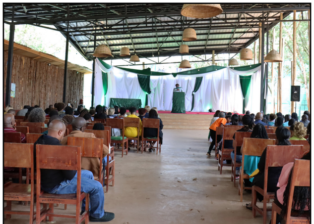
Class 8 transition ceremony at the Karen Campus, Multi-purpose Hall

and reinforces the supportive environment at NWST, which equips students with the skills and confidence needed for their next phase.