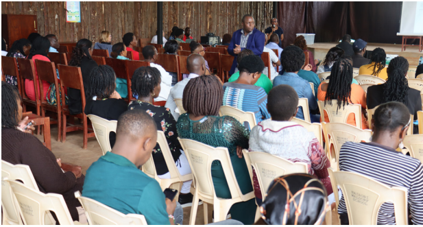
NWST Community at the AGM at NWST Karen, Nandi Road