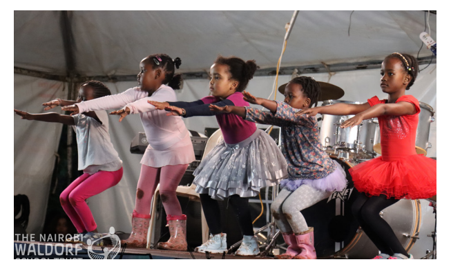
NWST Lavington Campus Kindergarten Performance