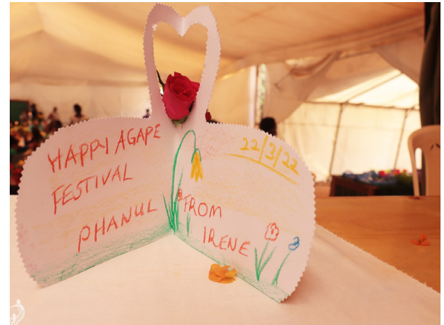
Cards and flowers prepared by NWST students