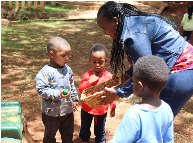
NWST Students during the Easter -Egg Hunt Festival

In Waldorf education, the Easter Egg Hunt holds a special significance as it is seen as a celebration of the renewal of life. The hunt is a celebration of new beginnings. The Easter Egg Hunt is not just about finding the eggs but is also an opportunity for children to develop social skills such as cooperation, sharing, and communication. Through working together and helping one another, children learn the value of community and the importance of relationships.