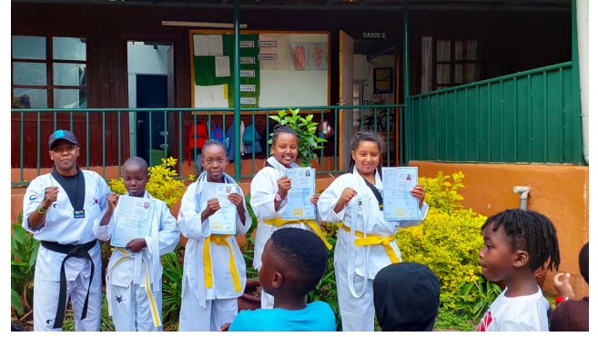
Nairobi Waldorf School Trust Taekwondo Trainees

I joined Taekwondo in class 4, term two 2022/2023 at Nairobi Waldorf School Trust Lavington Campus.I love Taekwondo because it teaches you how to be disciplined,