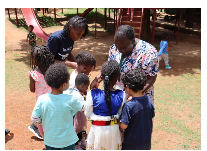
NWST Students during the Easter -Egg Hunt Festival

The event at the NWST Lavington Campus began with a story-telling session, which set the tone for the exciting day ahead. The children were then sent out to search for eggs hidden in different parts of the compound. The children were thrilled with excitement every time they spotted an egg, and they ran all over the compound, searching under trees, in fences, and other areas..