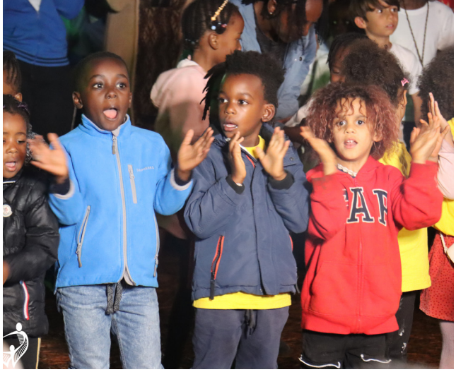
NWST Karen Campus Kindergarten Performance

The concert was a tremendous success, bringing together members of the NWST community and providing a platform for students to showcase their talents. The School Administration expressed gratitude towards all who participated and contributed to the success of the event.