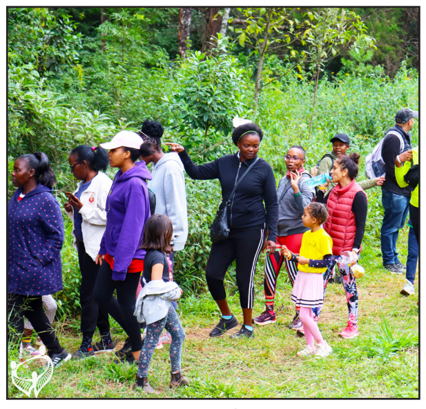
NWST Community at Ngong Road Forest - Section One

We want to extend our heartfelt thanks and appreciation to all the participants, especially the students, who made the NWST walkathon a resounding success. Your active involvement and enthusiastic participation, along with the sponsor forms you utilized to raise funds, were instrumental in helping us reach our goal.