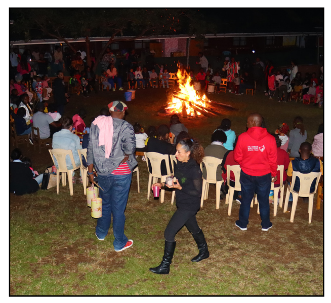
Bonfire during Lantern Festival, NWST Lavington Campus

The Lantern Festival took place on Friday, 9th June 2023 . This cherished event celebrated in Waldorf schools worldwide, is significant in nurturing the spirit of community, creativity, and togetherness. The Lantern Festival allows us to embrace the beauty of tradition and reinforces our School's values.