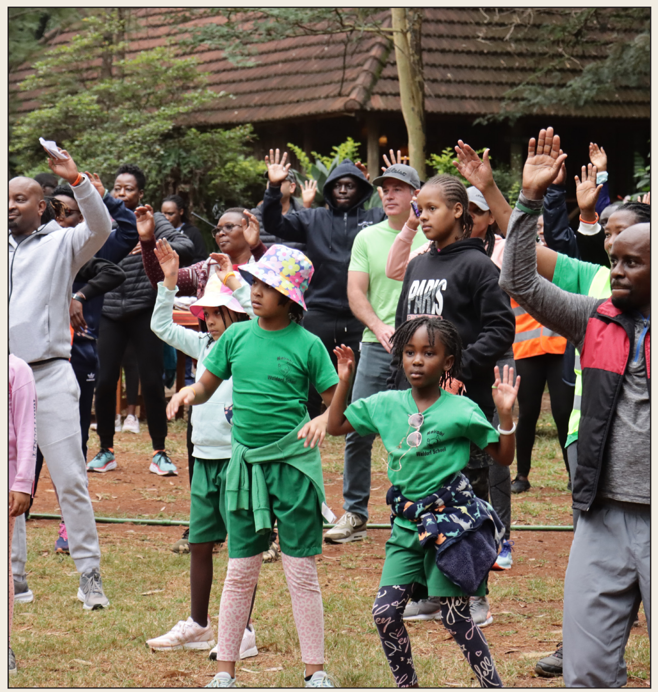
Warm-up session during the walkathon at NWST Karen Campus, Miotoni Road