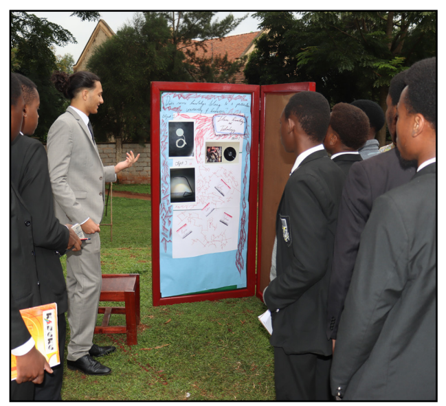
TOK Exhibitions at NWST, Karen Campus, Miotoni Road

As we reflect on the success of these exhibitions, we commend our students for their exceptional dedication, hard work, and intellectual curiosity. We are immensely proud of their achievements and look forward to witnessing their continued growth and success as they embark on their IB DP journey.