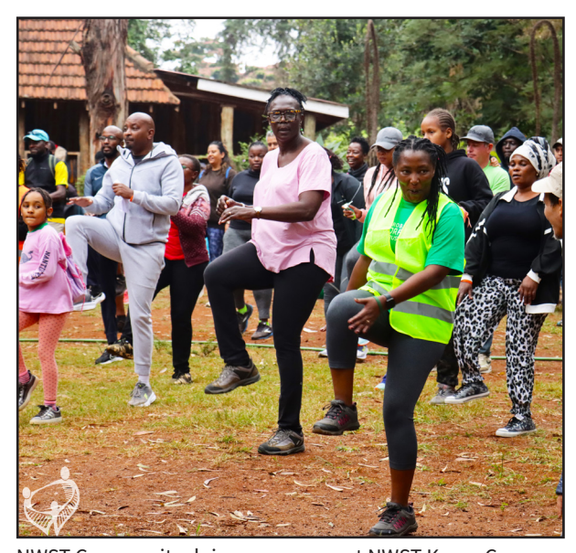
NWST Community doing a warm up at NWST Karen Campus, Miotoni Road

remarkable net income of Ksh 507,215 generated from the NWST Walkathon fundraiser. This