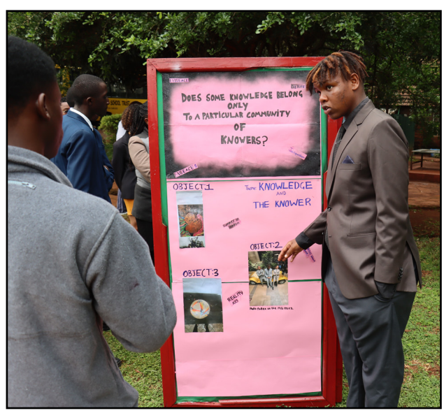
TOK Exhibitions at NWST, Karen Campus, Miotoni Road