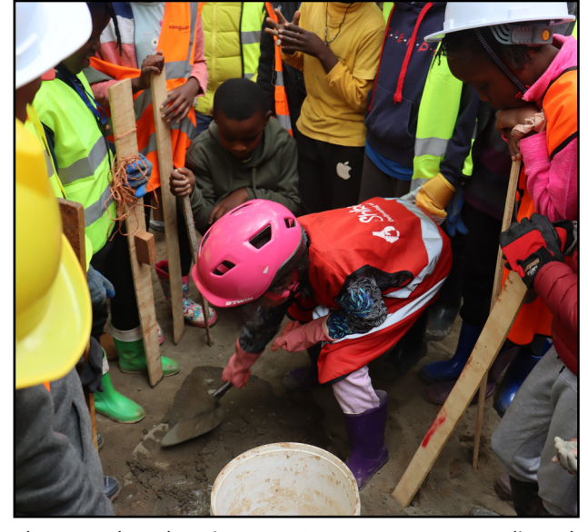
Class 3 Students learning at NWST Karen Campus, Nandi Road