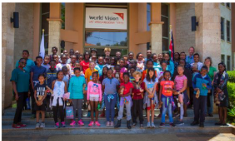
Primary Students at Word Vision in Karen.