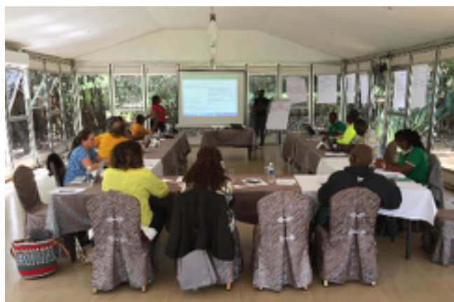
Strategic Planning on May 1, 2019.