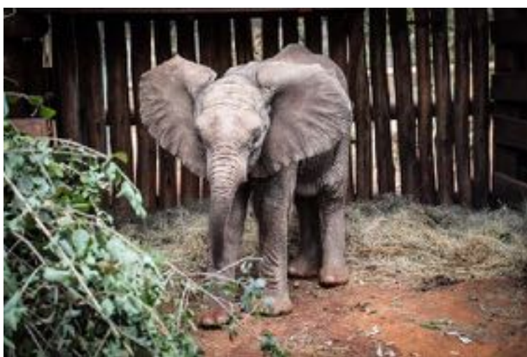
Class 1 has adopted Mukkoka.