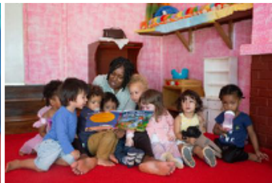
Lavington children in circle time, stacking rainbow structures, and reading a story.